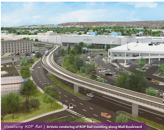
Visualizing KOP Rail | Artistic rendering of KOP Rail traveling along Mall Boulevard

GVF continues to advocate for the project and promote its benefits to the region. GVF, and its partner, the King of Prussia District, continue to actively gain support for the project through the King of Prussia Rail Coalition.