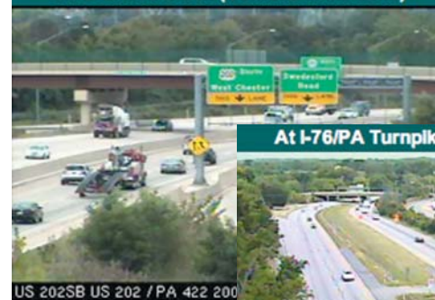
US 202SB US 202 / PA 422 200