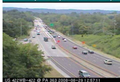
US 422WB-422 PA 363 2008-08-29 12:57:11