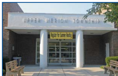
The Upper Merion Township Building, located at 175 W. Valley Forge Rd., King of Prussia, houses the main office of GVF Transportation.

Center which provides SEPTA and Rambler riders with a safe indoor waiting area. It's rare to find a transportation improvement initiative in the region that Upper Merion Township has not enthusiastically supported.