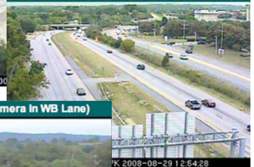
PA 363 2008-08-29 12:54:28