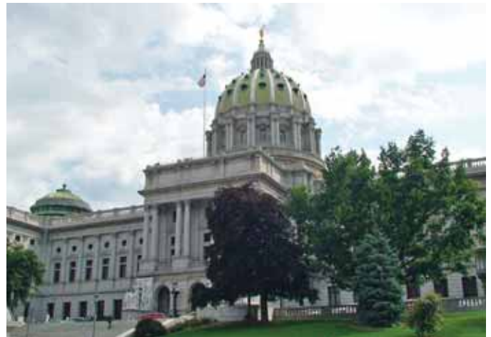
Pennsylvania State capitol building, Harrisburg, Pennsylvania.

As Governor Rendell convenes a special session of the General Assembly, GVF will continue to reach out to our legislators to express the importance of finding ways to close this massive transportation funding shortfall created by this decision. We will keep our partners up to date on this issue as new information arises.