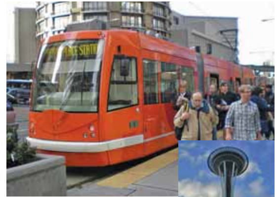
South Lake Union Streetcar (also known as the South Lake Union Trolley).

Smart growth is a movement nationwide and internationally, and one that GVF hopes will