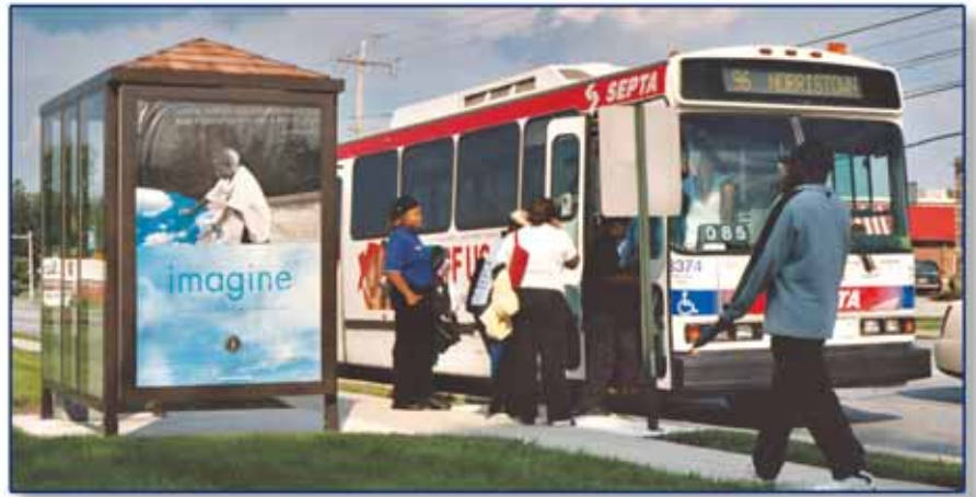
Another easy way to go green is taking SEPTA to work or to run errands.